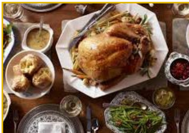
TABLE OF PLENTY – The Knights of Council 9487 will put on a Thanksgiving dinner with all the trimmings on Saturday, Nov. 18, in the Parish Hall.

A farmer named Muldoon lived alone in the countryside with a wee dog that he loved and doted on. After many long years of faithful companionship, the dog finally died, so Muldoon went to the parish priest: "Father, my dear old dog is dead. Could you be saying a Mass for him?" Father Patrick replied, "I am so very sorry to hear about your dog's death. But, unfortunately, I can't say Mass for the poor creature..." Muldoon said, "I understand, Father, I do. I guess I'll go